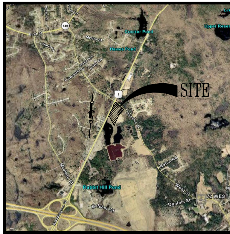
LOCUS MAP SCALE: 1"=1,000'

DEED REFERENCE: CERTIFICATE #143738 IN L.C. BOOK 719 PAGE 138 CERTIFICATE #163977 IN L.C. BOOK 820 PAGE 177 BOOK 18005 PAGE 293 PLAN REFERENCE: LAND COURT PLAN 14887 H